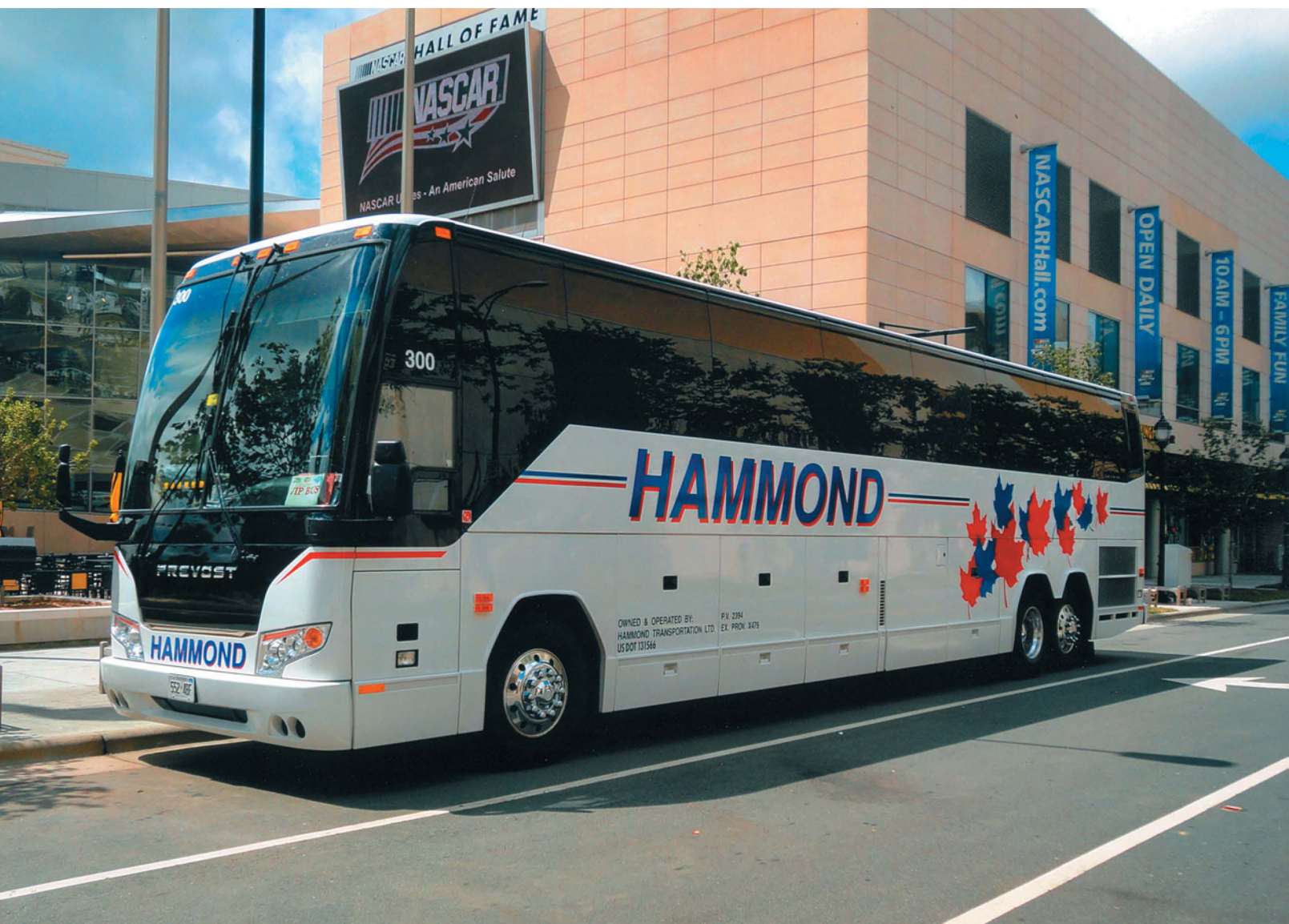
Hammond Transportation coach at NASCAR hall of Fame.